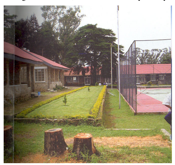
Figure 3:14 An image depicting improved accommodations and some sport facilities at the Ranch Mountain.

This policy thrust of the state raises a number of questions about the rationality of this kind of development strategy, in a country whose citizens live largely below the poverty line and lack the basic necessities of life such as medical care, water, food, shelter, and qualitative education. What administrative logic underlies such a huge borrowing on behalf of laboring taxpayers, for facilities that they cannot afford or will not enjoy? It might be interesting to know that since 2004, when the tourism bond was secured, the government had not given account of its expenditure nor revenue that accrued from the project. The government itself rationalizes its agenda as a development strategy intended to bring civilization to a supposedly backward place and peoples. As a way of marking a flourishing era after years of autocratic military governance, current political elites believe that such artificial initiatives (disneyfication) signify not only the development strategies' successes, but also the country's entry into modernity.