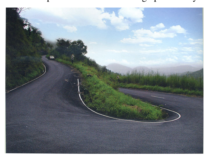
Figure 1:7 One of the 22 sharp bends leading up the Ranch Mountain Resort.

The Obudu Ranch Mountain, formerly known as the Obudu Cattle Ranch and currently referred to as the Ranch Resort, is located in Obanlikwu North of Cross River State, South-South of Nigeria. The Obudu Mountain, which is the highest in the state and the hilly lands of the Obudu and Obanlikwu areas, is "located on a plateau of about 1, 575.76 ...with an altitude of 1,716 meters above sea level" ("The Land" 18). The mountain also has a unique climatic condition in a predominantly tropical zone. The temperature in the mountain is "between 26-32 degrees centigrade between November and January while the lowest temperature range of 4 to 10 degrees is recorded between June and September" ("The Land" 18). Leading up to the Obudu Mountain summit is an 11-kilometer windy route with perilous bends amounting up to twenty-two in numbers.<sup>6</sup>