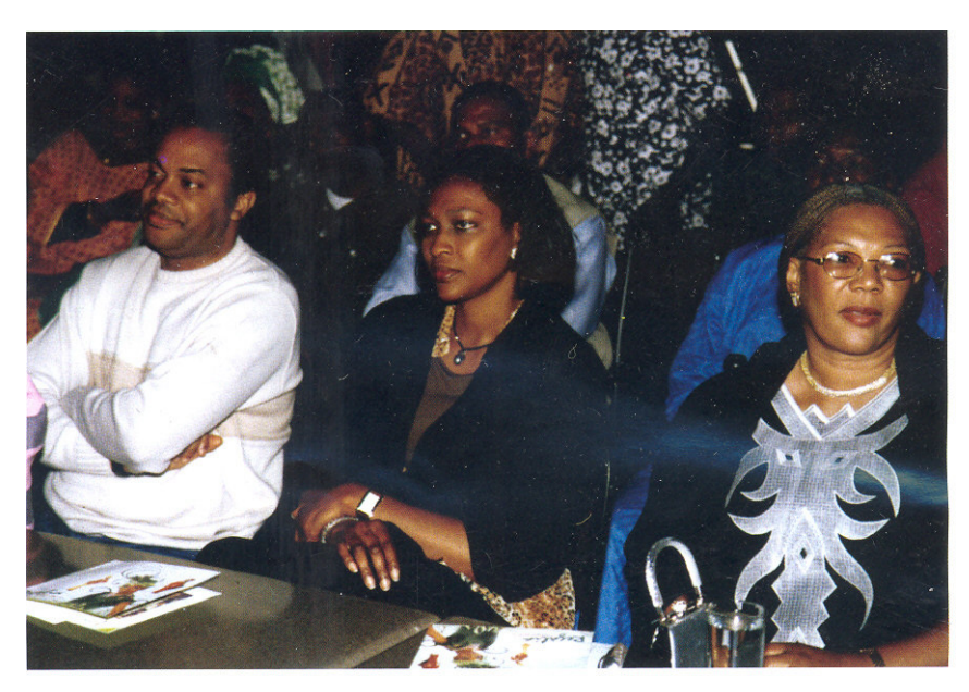
Figure 5:18 Governor Duke, his wife Onari, and other political acolytes at the Obudu Ranch Mountain.

The Obudu Ranch Mountain also provides the political elites some iconographic deployment of political contests between themselves. This is not an unprecedented social phenomenon because as David Robbins argues, "in reality conflicts between different bourgeois class fractions are expressed and resolved in the cultural sphere as well as those between bourgeoisie and proletariat" (582). With the reemergence of civil rule, "numerous local lordships" (Chatterjee 27) have emerged. These numerous political factions desperate to maintain a stronghold on their areas of influence are often engaged in fierce altercation between one another. I will cite the case of Senator Musa Adede and Governor Donald Duke to buttress my arguments. Between 1999 and 2003, Adede represented the Northern senatorial district at the federal legislature. In the contemporary Nigerian political world he was considered the political sheriff in his district made up of five local governments under which Obanlikwu, the municipality where the Obudu Ranch Mountain Resort is located, falls. As the political leader of this district, he ought to have unlimited access to any chosen port of call. But in 2003 he was refused entry into the Ranch Mountain on instructions from the state government led by Governor Duke (see Adeniyi 40). He had brought a powerful team of political confederates from the