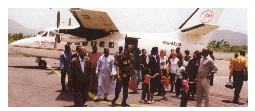
Figure 2:8 Governor Duke, family, and coterie of political loyalists

Today the Obudu Mountain has been transformed from its humble beginnings to an exquisite tourist site of international standards with "85 luxurious bedrooms ... an international conference center ... a 9-hole natural golf course, a standard squash court, two tennis courts, a water treatment plant, restaurant and bar, gymnasium and health space and a night club" (Adeniyi 40). Also, "to facilitate the movement of tourists to the ranch, a 1.8 km airstrip has been constructed at Bebi, about 40 km from the ranch" (Adeniyi 40), and there are speculations that the Federal Government might aid the state to extend the airstrip.