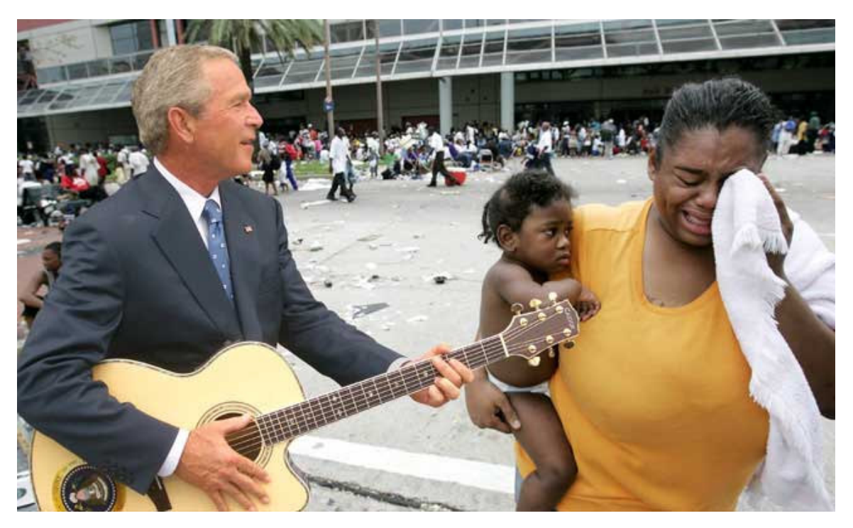
Fig. 3 – "CAY7UZ7L.jpg," Source and Date Unknown.

and digitally altered photographs poking fun at the president, his policies and his staffers. <sup>11</sup> (In just the last month, the number of sites featuring altered photographs grew more than ten-fold . <sup>12</sup>) Photographs from these web sites typically are produced anonymously, and they available for viewing (and copying) on the site. They have given rise to a new form of political cartoon. Images typically are shared by viewers as attachments to e-mail messages. Often, these images are so seamlessly crafted that it is difficult or impossible to discern whether the image is an un-tampered news photograph, or a Photoshop montage. E-mail attachments typically are circulated with no information about their authors, origins or the process by which they were made. They rarely confess to their artifice – if indeed they are false. In this paper, I will trace the production, dissemination and reception of one digitally altered photograph depicting the immediate aftermath of Hurricane Katrina at the Superdome.